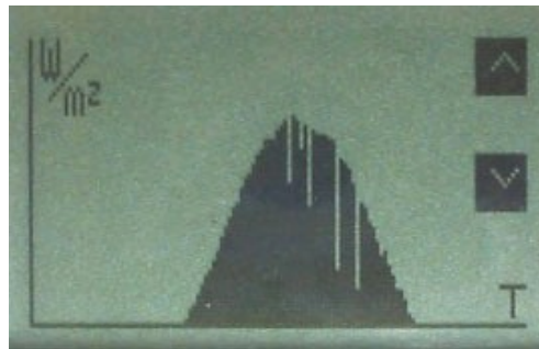
Graphic display 00H /24H

Scrolling of the successive graphs 00H-24H